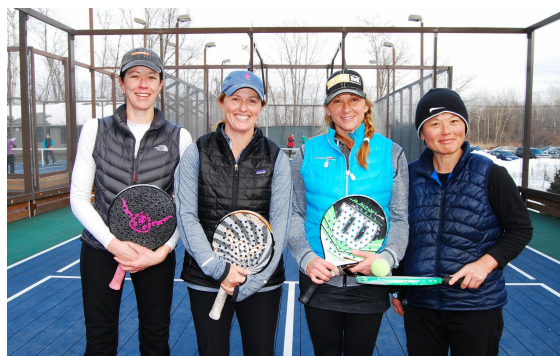
Above: The main draw finalists.